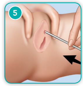
STEP 5: With one hand, spread the labia (the loose tissue on either side of the urethra) apart and lift it gently upwards. The urethra opening should now be visible.