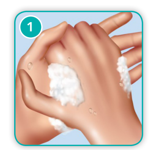
STEP 1: Wash hands thoroughly with soap and water.