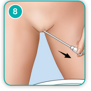
STEP 8: To make sure bladder is emptied completely, remove the catheter slowly and stop if more urine starts to flow.

When the bladder is empty withdraw the catheter slowly. Discard catheter after use. Wash your hands.