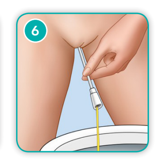
STEP 6: With the other hand, slowly push the catheter into the urethra until the urine starts to flow. Make sure the funnel end is pointing into a container.