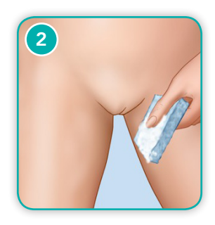
STEP 2: Clean the genital area from the front to the back, from the inside to the outside, with soap and water.