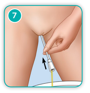
STEP 7: When the urine starts to flow, push the catheter in a little (one or two cms) to make sure that it is fully inside the bladder.